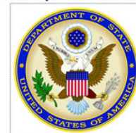
U.S. Department of State