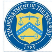
U.S. Department of the Treasury