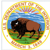
U.S. Department of the Interior