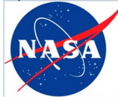
National Aeronautics & Space Administration